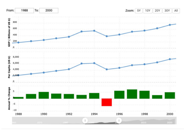
GDP of Mexico from 1988 to 2000

The countries in a situation of political and economic situations that directly or indirectly suffered the consequences due to the Cold War and other international or national struggles were in a time needing desperate guidance to protect people's economic rights to raise GDP for development. Figures 1 [1] and 2 [2] show the exact trend of the economic situation of some countries during that period from Macrotends.net. Vietnam has had two economic recessions, mainly a direct consequence of the end of the Cold War and the collapse of the Soviet Union that left them with no backer (89-90); second, was the Asian financial crisis in 1997. Mexico was in the 1994 presidential election, which caused an economic recession. Similar issues also occur in other parts globally during that period.