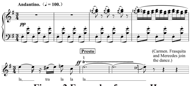
Figure 2 Example of a score II

Carmen's singing mood shifts subtly and dramatically. At first, her tone was hidden in the subtlety of the "p" (weak), which was ambiguous, as if she wanted to say something but did not want to. Then, it gradually shifted to the gentleness and delicacy of "sempre p" (soft), showing a different kind of tenderness and elegance. However, with the gradual accumulation and sublimation of the music's emotions, Carmen's tone of voice also became more impassioned, until in the climax of the music, it exploded into a "ff" (extremely strong) majestic power, impassioned, shocking the hearts of the people. In this process, the acceleration of the tempo and the degree of excitement of the tone form a perfect match, and together they push the wave of musical emotion forward. Finally, in the most passionate and intense climax part, the whole song reached the emotional peak, and then slowly fall curtain, leaving the listener with a deep aftertaste and endless reverie. Such as the score example two: