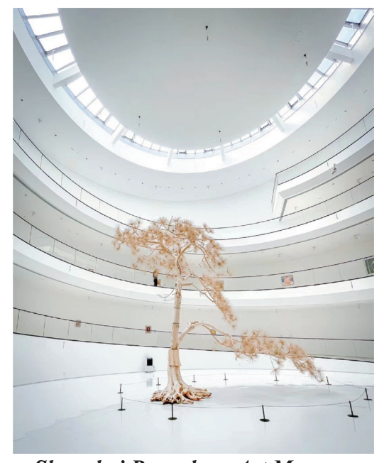
Shanghai Powerlong Art Museum

Within the context of the Cultural Industry, it's worth noting that such unique exhibition spaces are exclusive to museums like ours. They provide an exceptional cultural and artistic experience that can't be replicated elsewhere. The Shanghai Powerlong Art Museum offers a space where visitors can escape the ordinary, immerse themselves in art, and explore the harmonious fusion of tradition and modernity. This distinctive experience aligns perfectly with the cultural industry's mission to offer memorable and enriching encounters with art and culture.