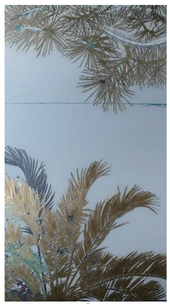
MATSUYA Chikako- « Seaside scenery-pine and sotetsu » 117.x65cm Tokyo

unique poetic narrative into her modern interpretations. Her art demonstrates the harmonious relationship between human emotion and artistic expression (Matsuya, 2018). These artists serve as the bridge between the ancient techniques and the contemporary artistic language, creating artworks that reflect the fusion of tradition and modernity. Their contributions exemplify the richness of cultural cross-pollination, showcasing the enduring appeal of the Japanese painting tradition.