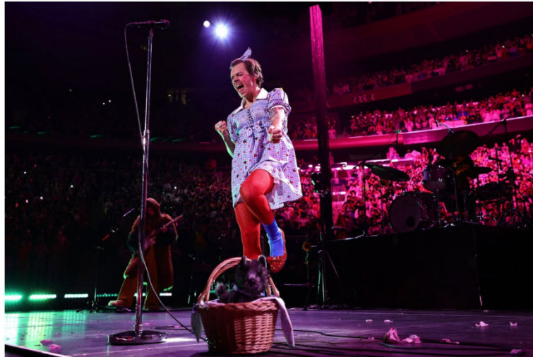
NEW YORK, NEW YORK - OCTOBER 30: Harry Styles performs onstage at Harry Styles "Harryween" Fancy Dress Party at Madison Square Garden on October 30, 2021 in New York City.

clothing, and have contributed to the popularization of genderless fashion worldwide[9].