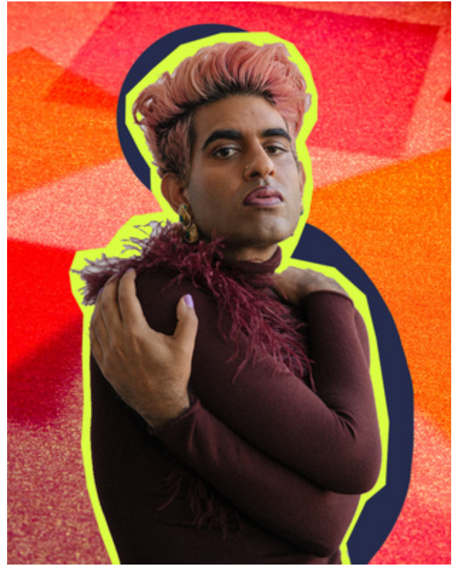
Fig. 3 Alok Vaid-Menon

The collective power of social media activism provides a virtual space for these marginalized voices to be heard and for a wider audience to be exposed to more fluid and inclusive gender identities.