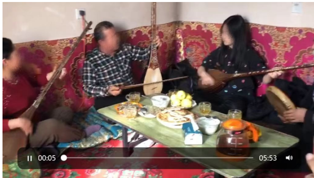
Figure 2. Joint performance by the Researcher and Intangible Cultural Heritage Inheritors (anonymous processed with the consent of the interviewees)

Cultural Heritage Park), Shache Museum, Kashi Museum, Amannisa Khan Memorial Mausoleum, and Shache Twelve Muqam Cultural Art Center. The author attended a local wedding and performed twice with the inheritor and his team. The author visited the home of a disciple and experienced the traditional-style teaching and learning process of Twelve Muqam. The author fully observed the routine performances of Twelve Muqam in the life of Uyghurs and the life of Uyghur Twelve Muqam learners. By deeply observing the collected materials, the author provided a third-party perspective and first-hand data to support historical archives and interview texts.