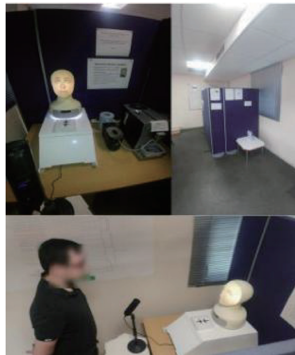
Figure 3 [6] . The Robo-Barista installation. Top left: inside the booth. Top right: the booth situated in departmental common room. Bottom: the user who is interacting with Robo-Barista.