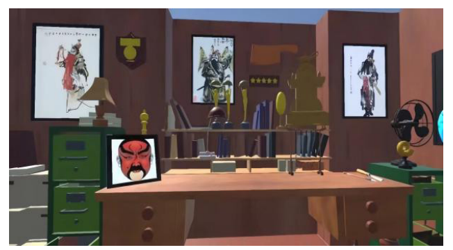
Fig. 1. Scene 1

After putting on the mask, the player will switch to Scene 2, the theme of this scene is the stage, in 3dsmax software, this paper first built the basic framework of the stage with geometric figures. Using basic geometry and splines to build the crowns, costumes, and some embossing objects needed for the drama, it is then converted into edgeable polygons in the modifier, modifying the detailed parameters using extrusion, smoothing, symmetry, capture, etc., and finally building a scene composed of wooden platforms, costumes, and accessories (Figure 2). The style of the stage scene is slightly different from the bedroom scene, but since the focus is on the drama on stage, the overall color of the scene is brown and warm to highlight the changes on stage [7].