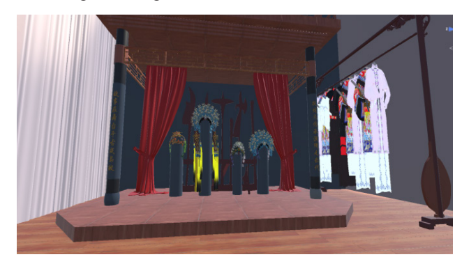
Fig. 2. Scene 2

After putting on the mask, the player will switch to Scene 2, the theme of this scene is the stage, in 3dsmax software, this paper first built the basic framework of the stage with geometric figures. Using basic geometry and splines to build the crowns, costumes, and some embossing objects needed for the drama, it is then converted into edgeable polygons in the modifier, modifying the detailed parameters using extrusion, smoothing, symmetry, capture, etc., and finally building a scene composed of wooden platforms, costumes, and accessories (Figure 2). The style of the stage scene is slightly different from the bedroom scene, but since the focus is on the drama on stage, the overall color of the scene is brown and warm to highlight the changes on stage [7].