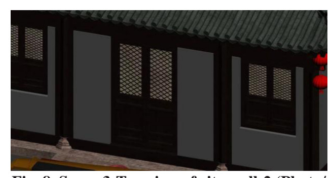
Fig. 8. Scene 3-Top view of city wall-2

In order to explore the reasons for the low score, this paper conducted in-depth interviews with players on their comments on various aspects, and found that players were affected by the detail rendering when roaming and exploring the scene, such as the color matching and brightness of the tower, the texture effect of small models such as incense burners, the simulation effect of the Tengman [5,6], and the types of grass vegetation, etc., and they were affected by these influences and discounted the sense of representation in the scene when roaming. Below are some roaming experience and detailed renderings of Scene 3 (Figure 8 and figure 9).