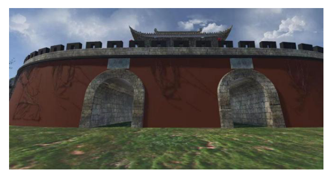
Fig. 3. Scene 3

In 3dsmax, the uneven round model with many folds at the edges is realized by turning function, and the brick tile of the eaves is first bent by one tile and then achieved by stacking form, the effect is as follows [3].