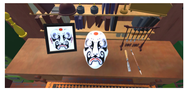
Fig. 7. Painted face mask

In the face mode switching, the quest3 device's gesture recognition function realizes the accurate capture and recognition of the player's hand movements. By recognizing