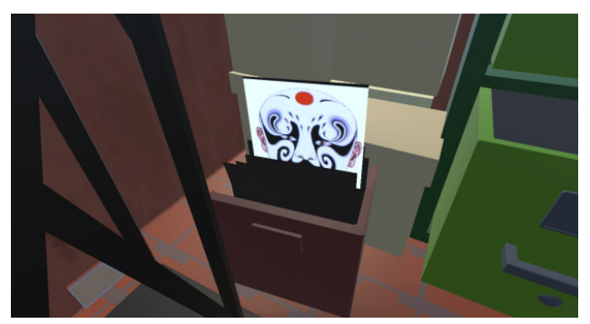
Fig. 5. Design drawing stash

On the mask model represented by each type, this paper used a face-changing technique to unlock different faces of the same type on the mask model through specific gestures. For example: the player has collected the Sheng type design drawing and mask model, just pinch the two points in front of the mask and slide to the right, the Sheng type mask will have two facial patterns alternate. Such gesture interaction design simulates the waving of hands and changing faces in the drama of changing faces, allowing players to achieve an immersive feeling with realistic gesture simulation, allowing players to actually change faces, which can bring players a more intuitive cultural experience (Figure 6 and figure 7).