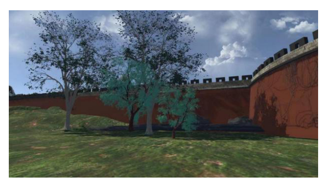
Fig. 9. Scene 3-Exterior scene of city wall